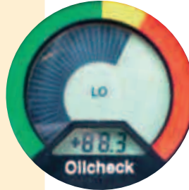
Green/amber/red numerical value